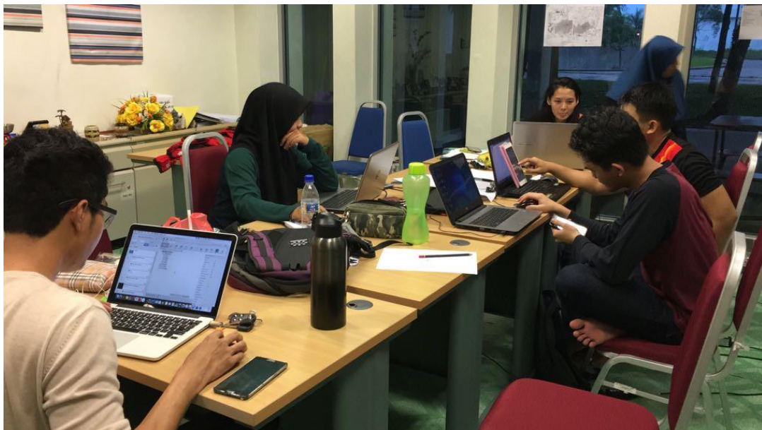
Figure 1: Participants is doing their parts in the competition

The essential expectation of this design competition is to give students from architecture and civil engineering in Malaysia with the special chance to work together in a building outline that utilizes steel as the primary auxiliary and completing material. It is for these students to get a handle on the reality that building configuration does not exist in the ward of the designer or structural specialist separately, yet it is a method for them to touch base at a significant acknowledgment of both architectural fascination and structural manifestation. It plans to cross over any barrier between the training of architecture and civil engineering.