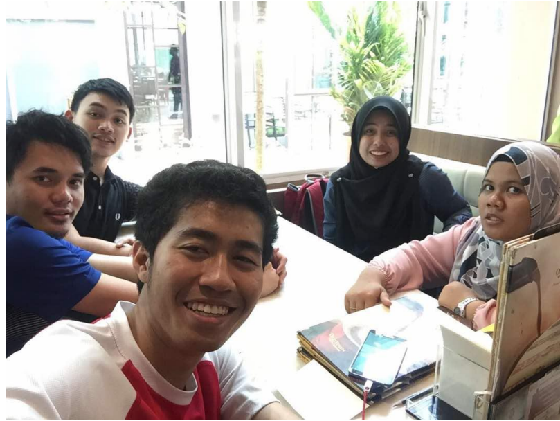
Figure 4: Participants having lunch after submitting YouDo project