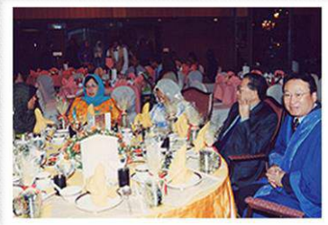
the 1 st Convocation 26 th March 2004