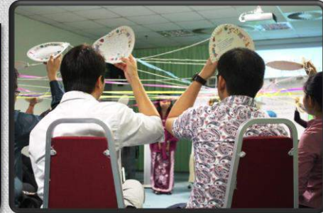
Scenes from the LEARNING SESSIONS